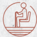
SENIOR CITIZEN SEATING