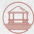
KING SIZE GAZEBO