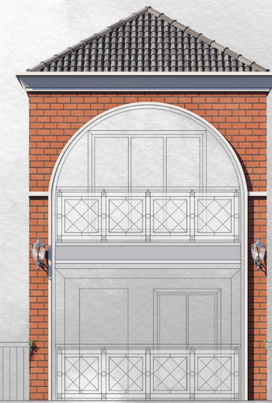
RESIDENTIAL OPEN PLOTS